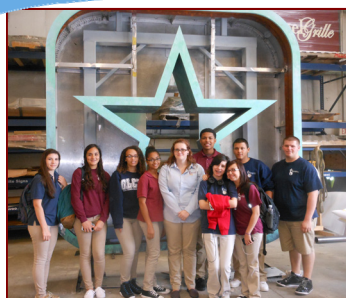
High school students tour Poyant Signs in New Bedford to learn about sign design and manufacturing