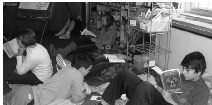
Mrs. Clark's reading zone

Sixth-grade students at Cummings Elementary chose their first book of the year their very first day of reading class. Due to their classrooms being fully stocked with the latest and greatest reads for middle grade students, everyone was able to get what they wanted, even though the school's library wasn't open yet.