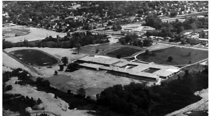
Aerial photo, 1964