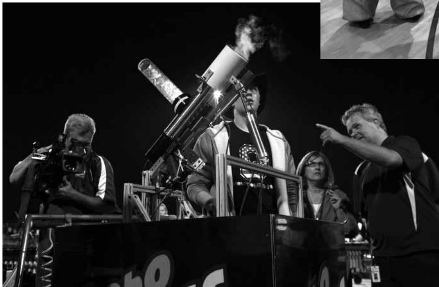
At the homecoming game, the RoboDawgs debuted a new robot with a cannon capable of launching foam footballs more than 300 feet.