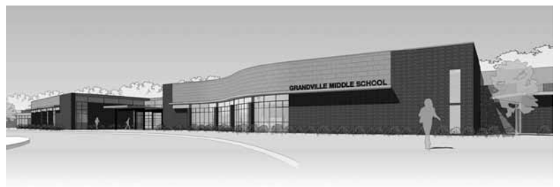
EAST EXTERIOR ADDITION [CAFETERIA + ADMINISTRATION] - NORTHEAST VIEW