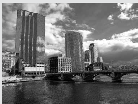
“Skyline in Red”